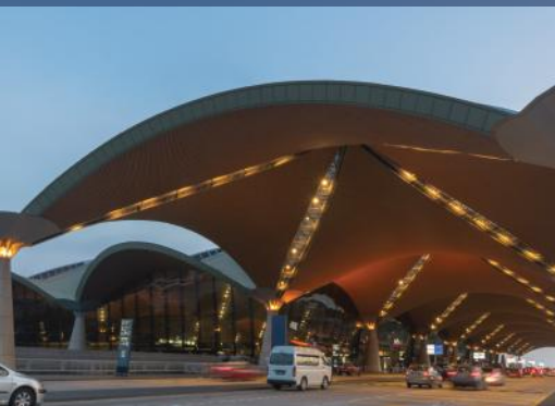
Kuala Lumpur International Airport