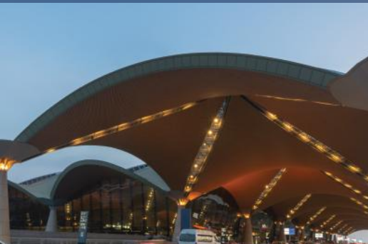
Kuala Lumpur International Airport